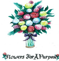
Illustration by the late Jim Bennett

Back by popular demand and for the 3rd year in a row, KBDF is honored and proud to offer the KBDF Memorial Flowers For A Purpose Garden Bouquet. For a $100 donation, each donor will receive a beautiful bouquet created by the FFAP Team led by Dolores Bennett. The Bouquets are arranged on white table cloth tables under canopies set up on the lawn at the back of the club house. A personalized 8x12 Sign adorned with a print of hand painted flowers by the late Jim Bennett is included with each sign, created in honor or memory of a loved one or for someone special. Donors can take their bouquets home as a beautiful reminder of the honoree. Those not taken home will be donated to Manor Lake Assisted Living residents.